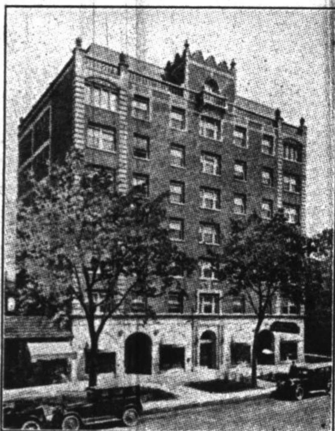
THE LIBRARY PLAZA, Orrington at Church. Another successful Carlson property in central Evanston.

The first step is to save money. Under The Carlson Plan you receive 6 per cent interest while saving. Or you can immediately secure part ownership in centrally located income property with an investment of $100 or more.