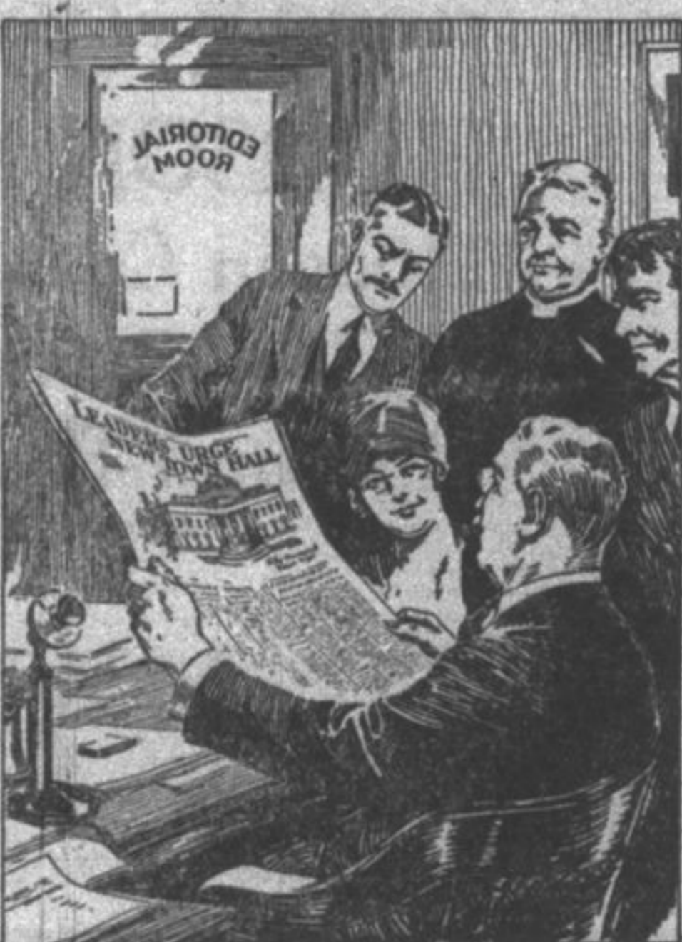
Bank of the Manhattan Co., N. Y. The newspaper mobilizes the best citizens of the community into a force for progress

Again, the publisher of a large city newspaper in the heart of the Great Wheat