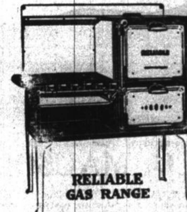
RELIABLE GAS RANGE

Gas Ranges equipped with Lorain Oven Heat Regulators makes baking always a certainty.