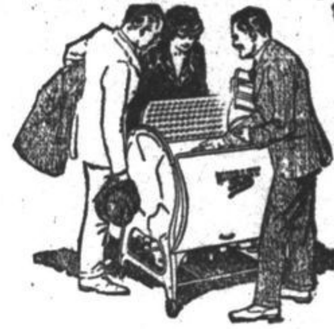
The Thor Cylinder Washer thoroughly cleans all your family wash from the daintiest lingerie to the heavier garments of the shop man.

$5.00 down payment and a liberal price reduction on Laundry Appliances. It will be to your advantage to purchase during this sale.