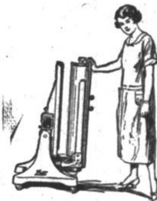
Canton Clothes Dryer dries your clothes regardless of weather conditions winter as well as summer. No hanging clothes outside in cold, windy weather.

FREE—A 6-Pound Gas Iron with the sale of one of these Laundry Appliances.