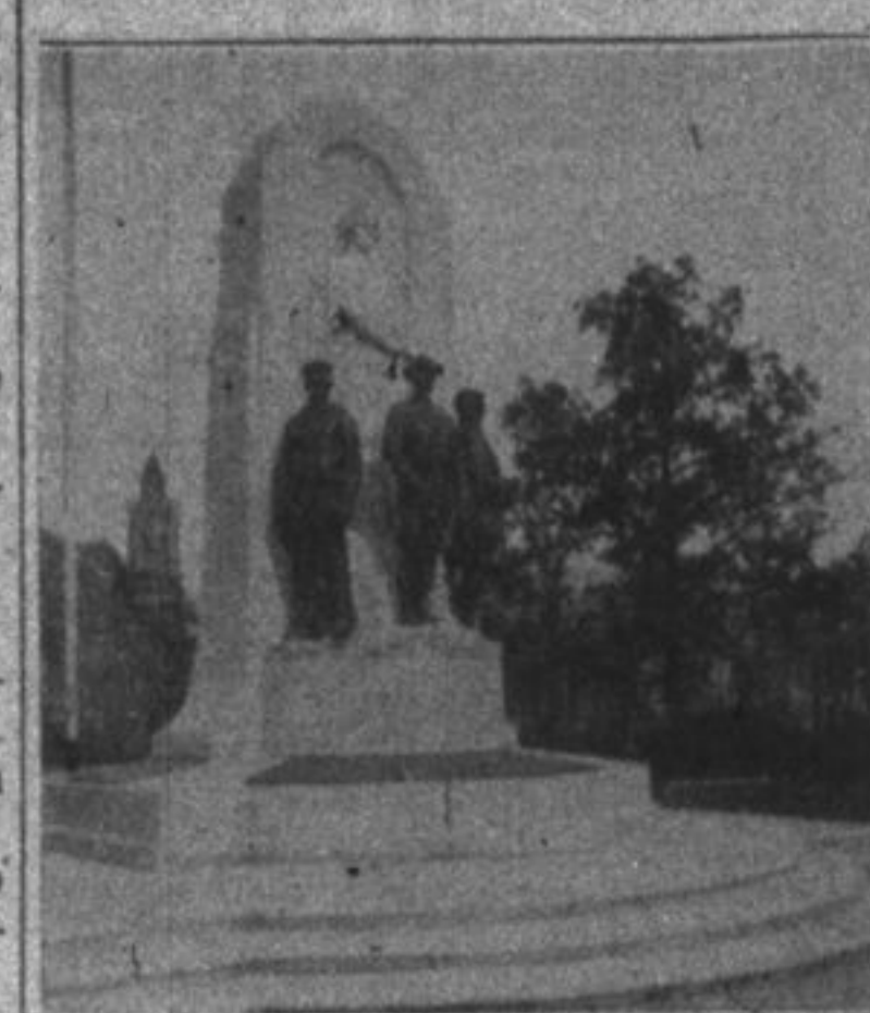
SOLDIERS MEMORIAL OAK PARK

The vagrant element always have been called "tramps," but they don't wear out shoe leather tramping now.