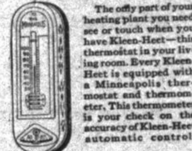
The only part of your heating plant you need see or touch when you have Kleen-Heet—this thermostat in your living room. Every Kleen-Heet is equipped with a Minneapolis thermostat and thermometer. This thermometer is your check on the accuracy of Kleen-Heet automatic control.

A product of the Winslow Boiler and Engineering Co. Chicago, Illinois