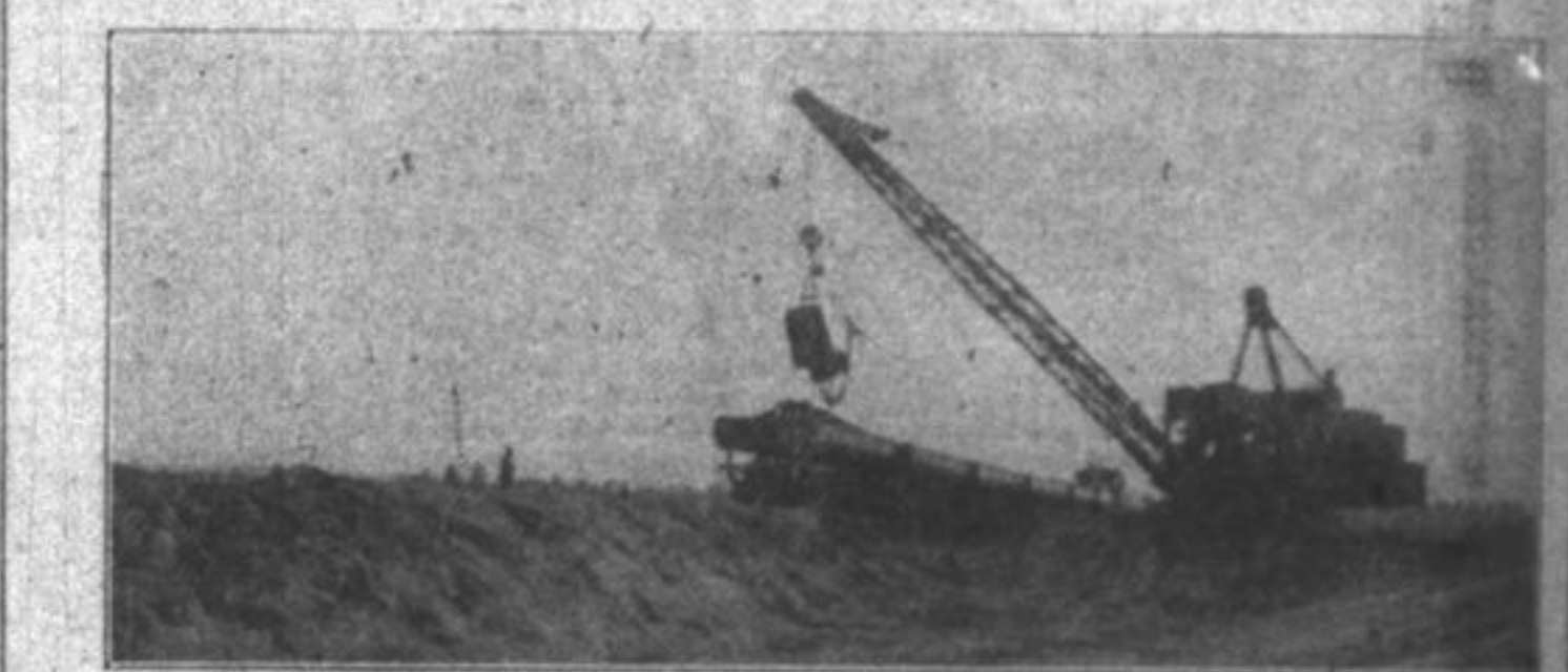
Digging Artificial Lake near Libertyville, Illinois

a bread-mixer and a bread-slicer. Coffee urns of 80-gallon capacity each occupy a convenient space in the kitchen, and there are potato-peeling machines, dish-washing machines, a refrigerator plant, meat-cutting machines and everything that is necessary to prepare wholesome food in the cleanest and quickest manner possible. All the cooking is done with gas and the machines are all electrically operated.