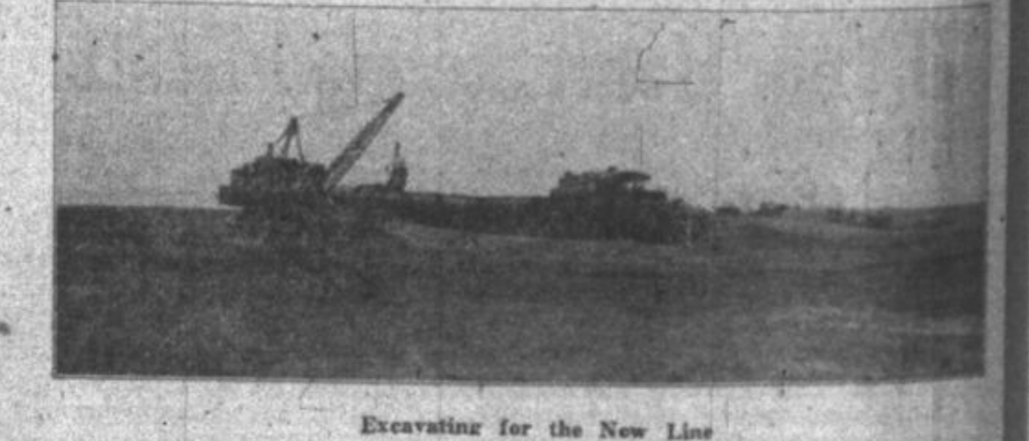
Excavating for the New Line

that rather appeals to the visitor unaccustomed to such dining rooms, or rather mess halls. They have nothing of that daintiness that so many of us crave in the dining room of the large hotel or restaurant, but they give the impression of virility, of being admirably suited to provide good wholesome food for strong, rugged, red-blooded men who are quite as necessary in our scheme of civilization