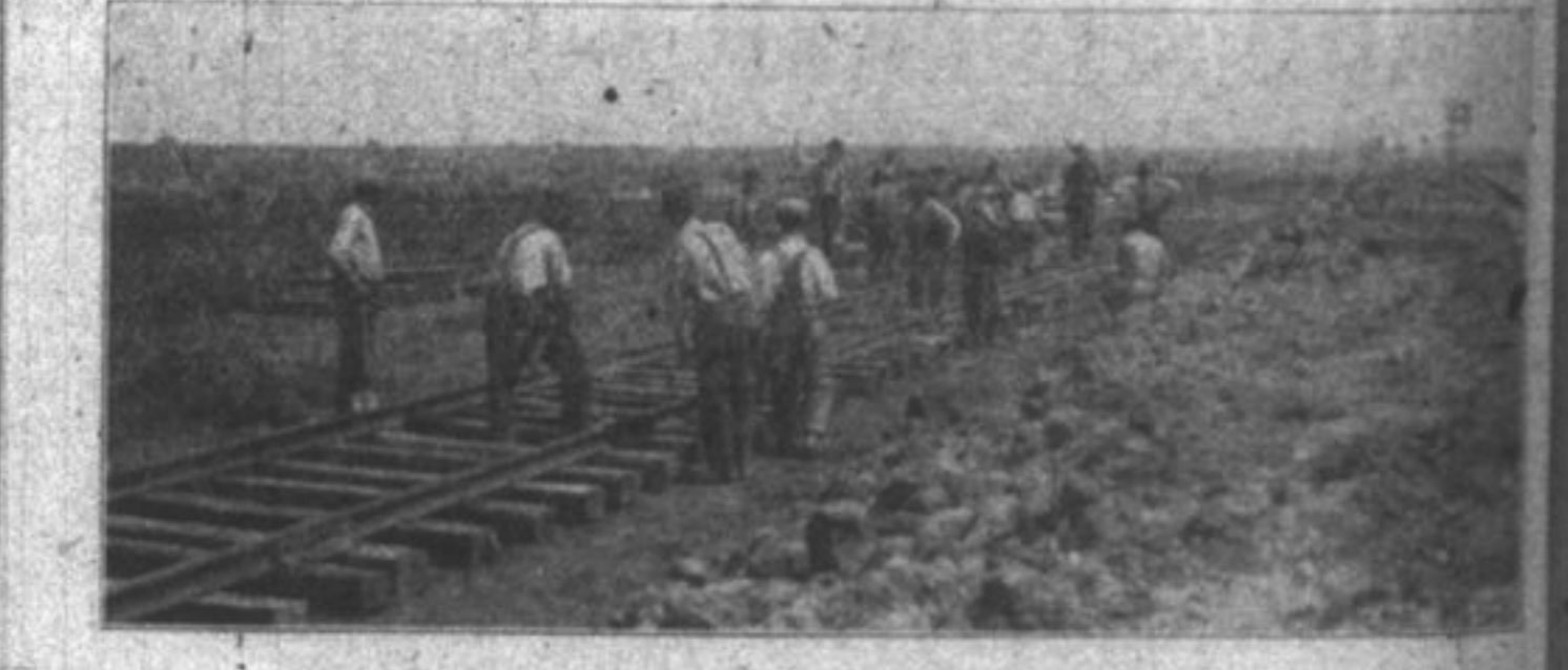
Laying Temporary Railroad for Hauling Gravel

"The refrigerating plant is a portable one. It is set on trucks and can be moved with little effort when a new camp is located. All that is necessary is to run it to the desired location, attach the electric connection and have refrigeration. "The dining room at both camps are 200 feet in length and 50 feet in width and seat about 500 men at one time. There is something about them