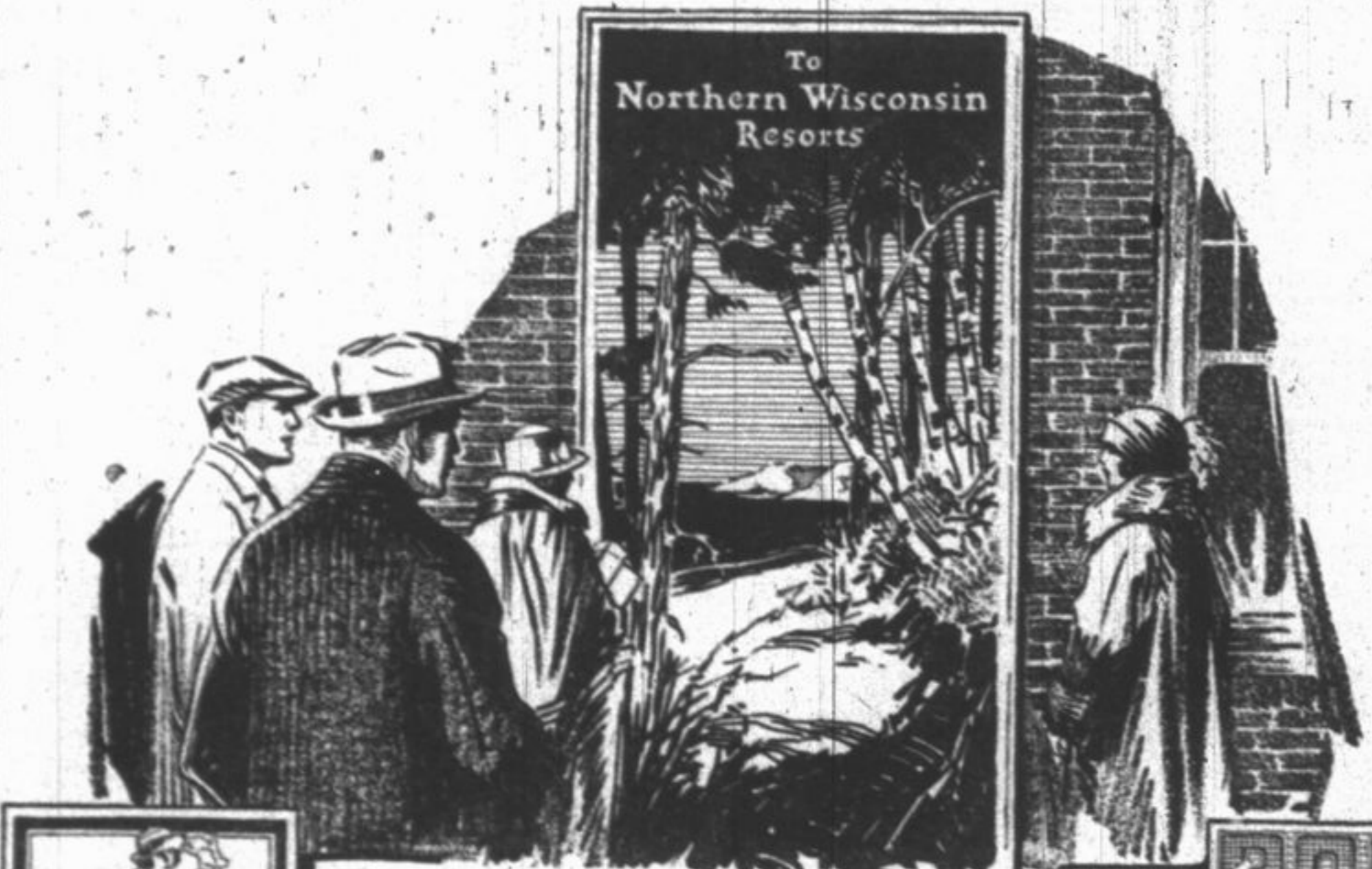
To Northern Wisconsin Resorts