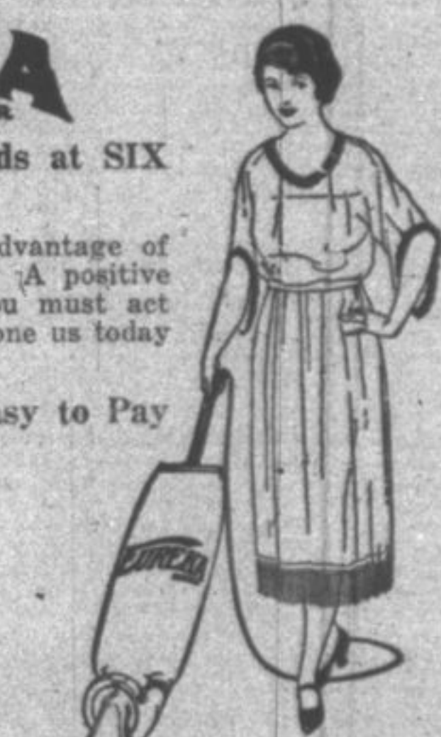
It Gets the Dirt

You need pay only $5.00 down and the balance on low easy monthly payments and the attachments cost you nothing. Call at our store or phone us and we will gladly demonstrate the Eureka and its famous attachments in your own home without cost or obligation before you buy.