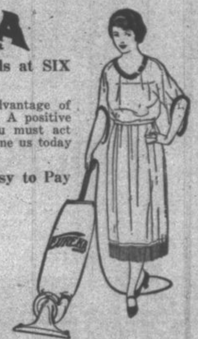
It Gets the Dirt

You need pay only $5.00 down and the balance on low easy monthly payments and the attachments cost you nothing. Call at our store or phone us and we will gladly demonstrate the Eureka and its famous attachments in your own home without cost or obligation before you buy.