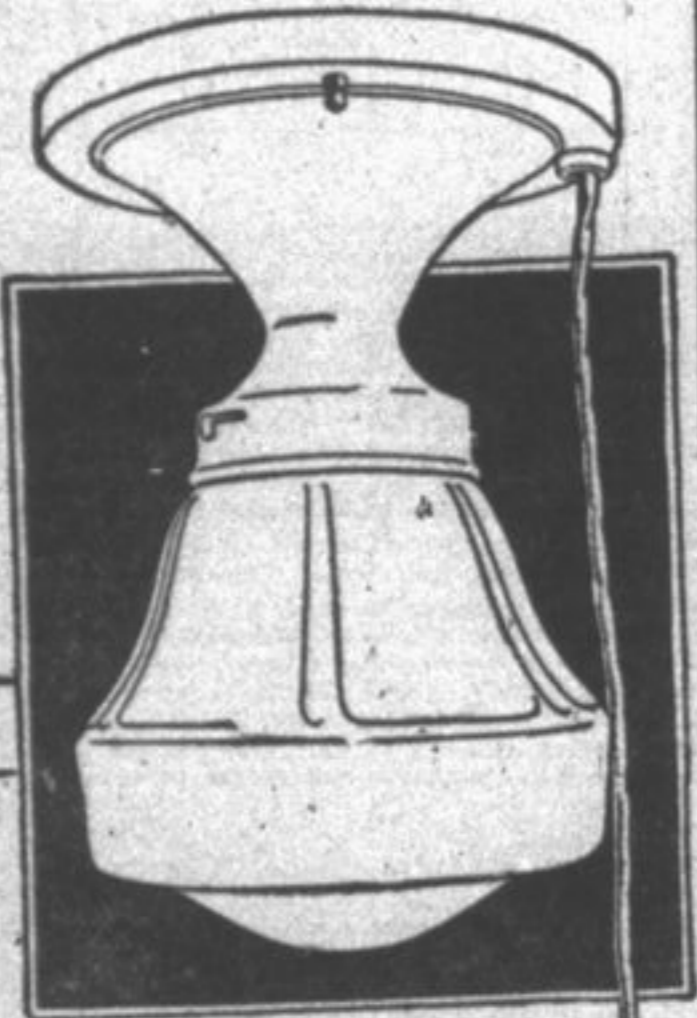
Light turns on and off at this handy pendant switch and you can also plug in your iron or toaster here. See the picture at the left.

Snowy white is this new kitchen fixture—white porcelain enamel on Armo rust-resisting metal and white embossed glass-ware. Easy to keep spotlessly clean.