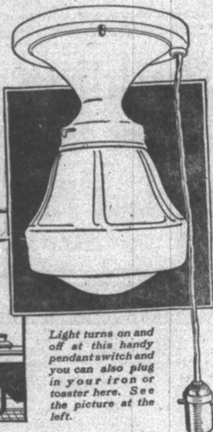
Light turns on and off at this handy pendant switch and you can also plug in your iron or toaster here. See the picture at the left.

YOUR kitchen is the workshop of your home and should have bright, cheerful illumination day and night. We will install one of these new all-white Daylight Lighting Fixtures on trial if you now have an outlet in your kitchen ceiling. We furnish everything including a new Mazda lamp for lighting the fixture. Easy monthly payments with your electric bills. Only $1.00 Down