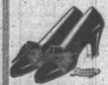
The "SAILOR TIE" $8.00