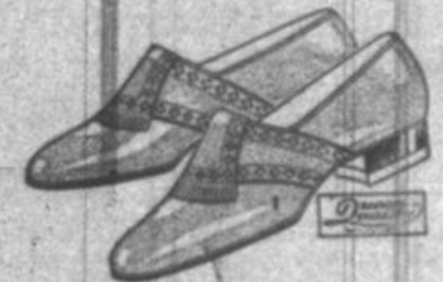
The "CALIPH GORE PUMP" $8.00

DON'T WAIT UNTIL THE SPRING COMES AND PRICES ADVANCE