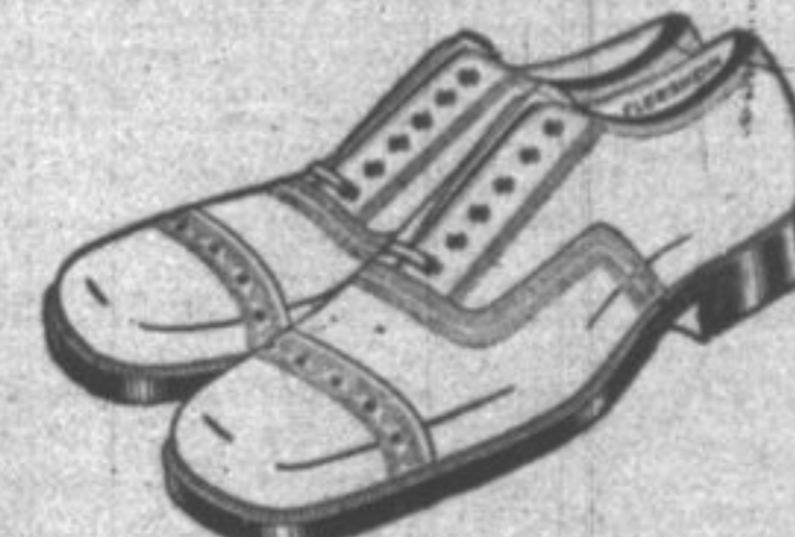
The "BROGUE" $10.00

We take special pride in the fitting quality of our styles. Correct fit means better style, better wear, better value. Many other styles to choose from.