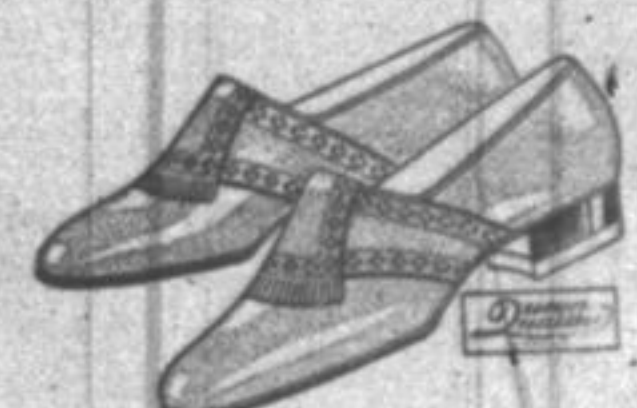
The "CALIPH GORE PUMP" $8.00