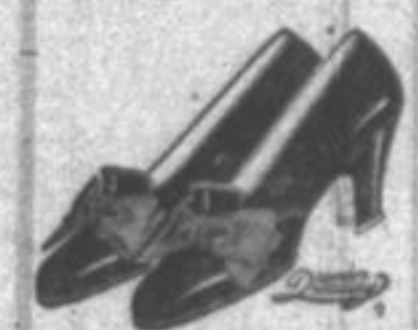
The "SAILOR TIE" $8.00