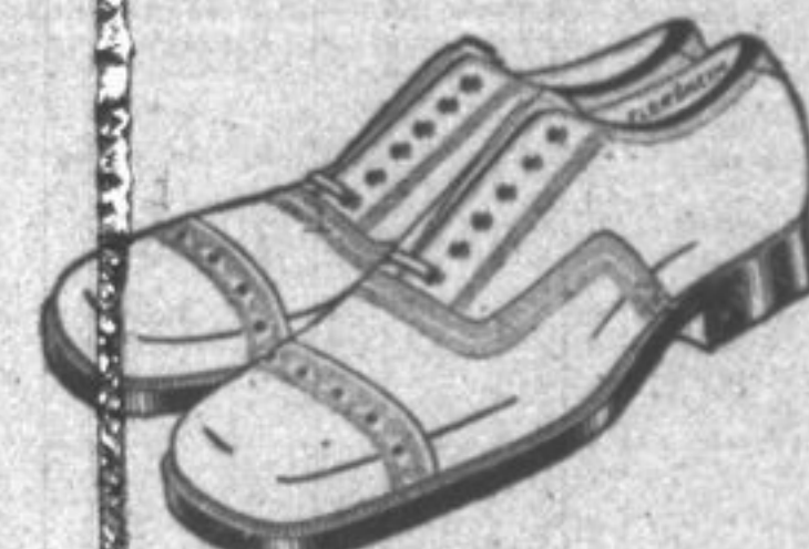
The "BROGUE" $10.00

We take special pride in the fitting quality of our styles. Correct fit means better style, better wear, better value. Many other styles to choose from.