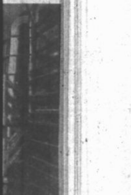
Northwestern view of Lake Michigan from the bluff