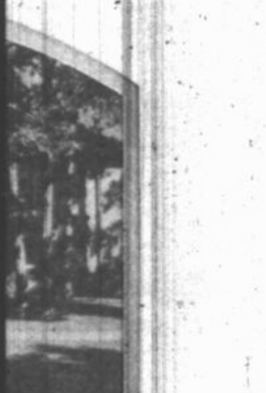
Northwestern view of Lake Michigan from the bluff