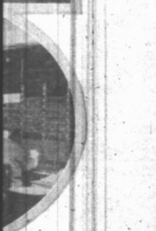
Northwestern view of Lake Michigan from the bluff