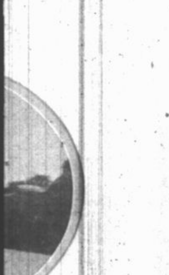
Northwestern view of Lake Michigan from the bluff