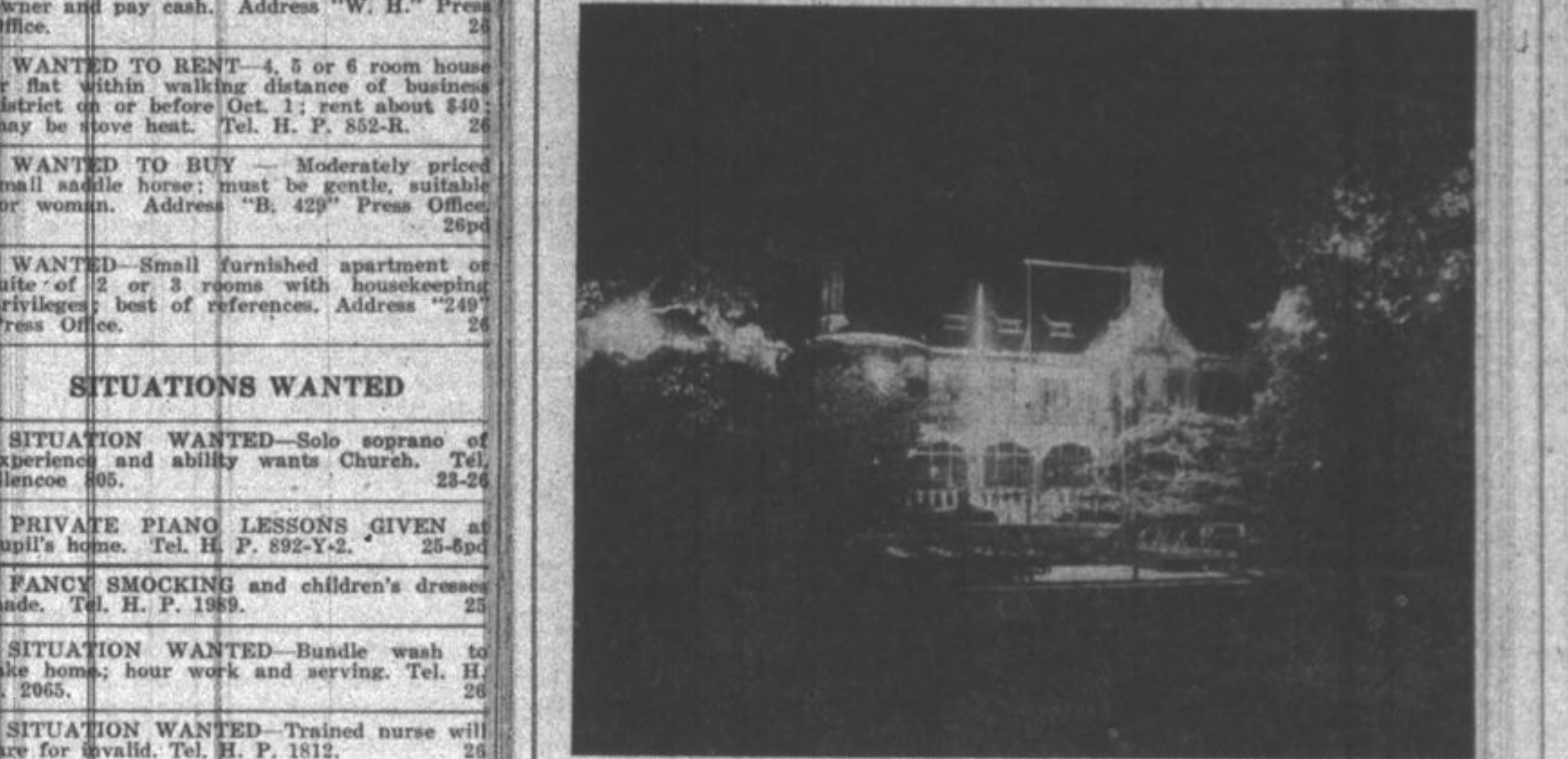
Above is a remarkable photograph of Gen. Chas. G. Dawes' home at Evanston on the night of his notification. The photograph was made through the co-operation of Public Service Co. lighting experts.