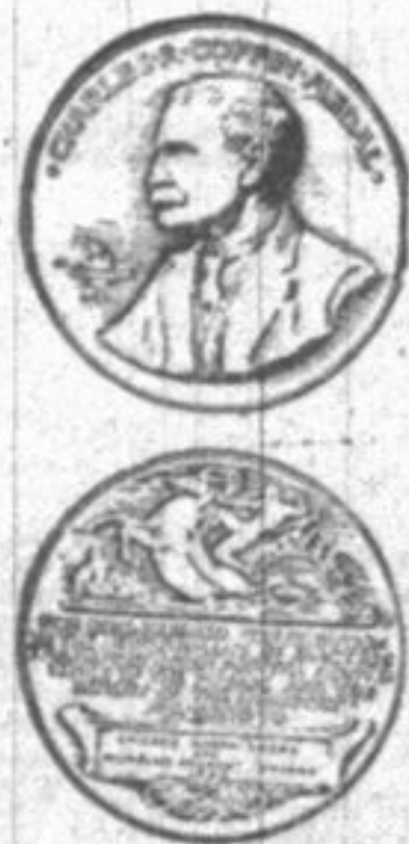
The Charles A. Coffin Medal awarded to the North Shore Line for distinguished contribution to the development of electrical transportation for the convenience of the public and the benefit of the industry.

That the people of this territory have adopted the North Shore Line as their own particular railroad is not surprising, since the North Shore Line has pledged it the finest transportation service that it is able to give.