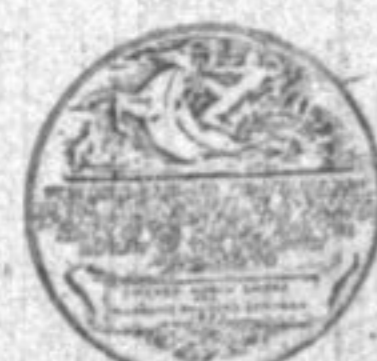
The Charles A. Coffin Medal awarded to the North Shore Line for its distinguished contribution to the development of efficient transportation for the convenience of the public and the benefit of the industry.