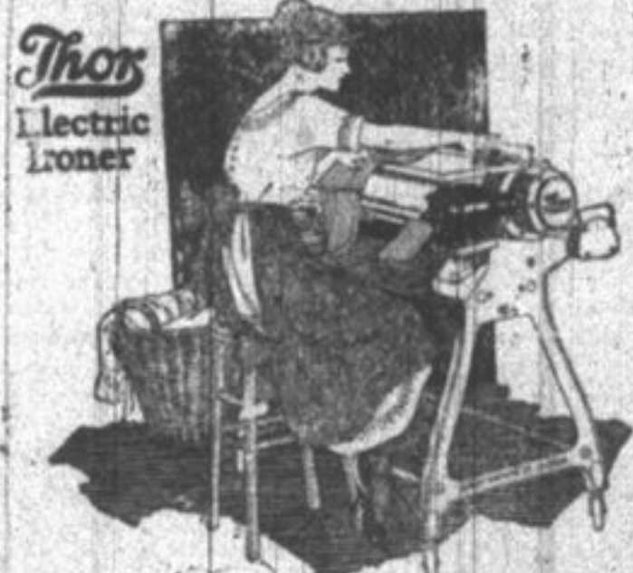
Thors Electric Ironer Irons Shirts, Dresses Everything in the family ironing

"SERVICE SELLS" FREE—Services of our experienced mechanic for one year with any machine purchased at our store.