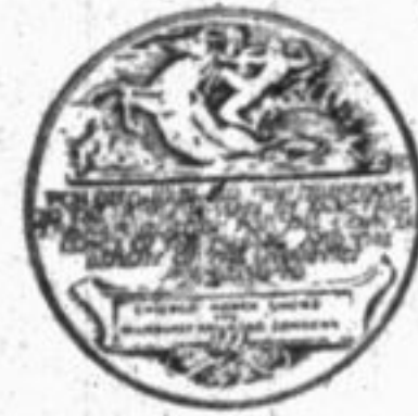
The Charles A. Coffin Medal awarded to the North Shore Line for distinguished contribution to the development of electrical transportation for the convenience of the public and the benefit of the industry.

"I want to write and tell you of a collector on your train between Chicago and Milwaukee. I wish to recommend him most highly. He creates quite an atmosphere on his train because he is so helpful and interested in the comfort of his passengers. I have watched him assist cripples on and off; I have seen him help women with children; I have watched the interest the passengers have in him. They all seem to know him and like him."