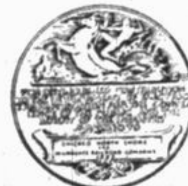
The Charles A. Coffin Medal awarded to the North Shore Line for distinguished contribution to the development of electrical transportation for the convenience of the public and the benefit of the industry.