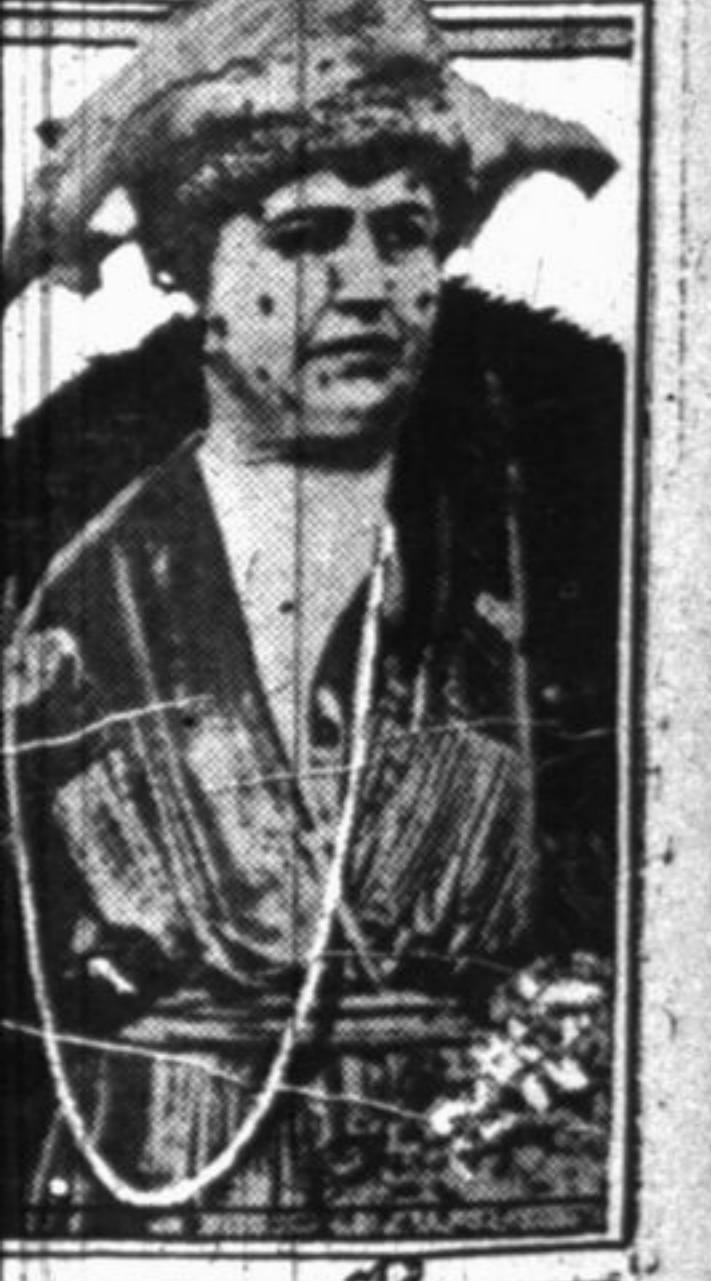
Woodrow Wilson, widow of former president, who lovingly been his constant companion since his physical break before the completion of his term of office. Upper, as she red when she became his wife during his presidency, the most recent picture of