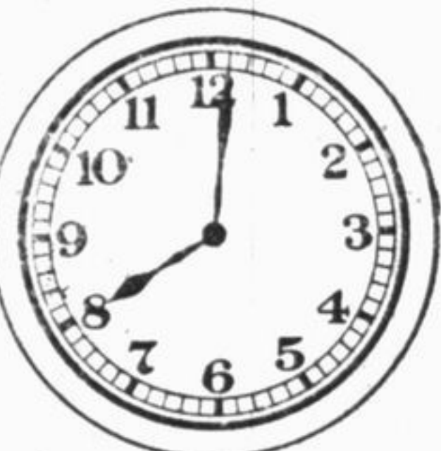
A Ton of Coal a Minute