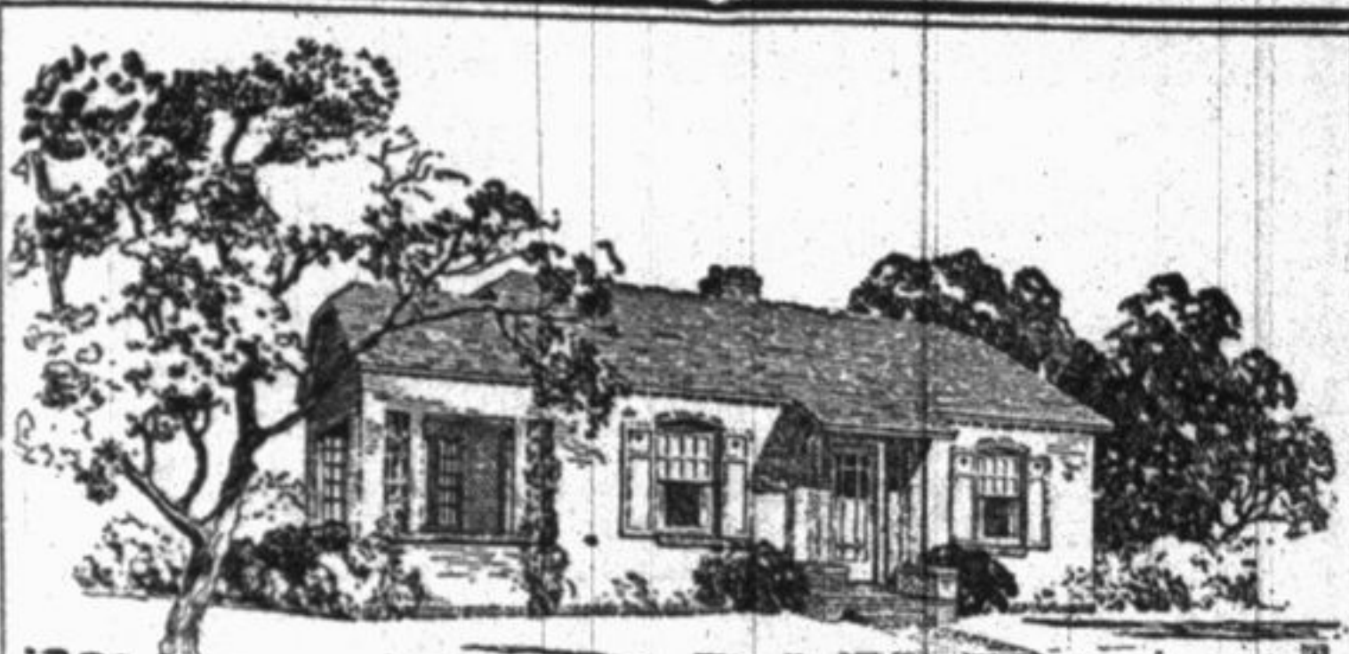
HOUSE No. 406

HIGHLAND PARK, ILLINOIS Phones: Highland Park 120 - 121