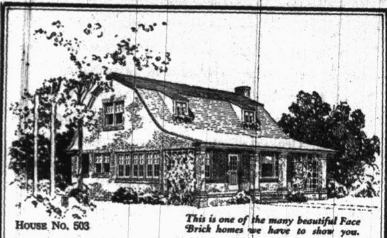
House No. 503