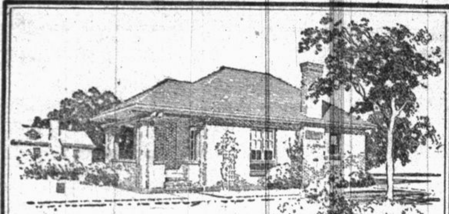
HOUSE No. 404