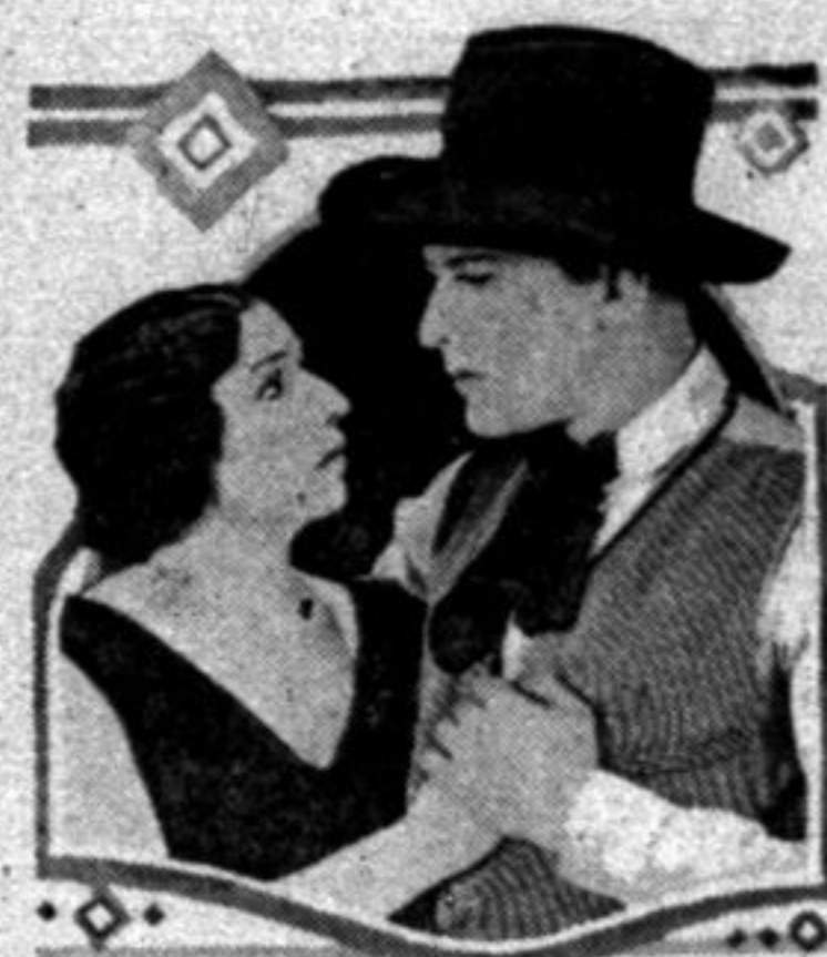
FRANK MAYO in "CAUGHT BLUFFING" A UNIVERSAL ATTRACTION

ADMISSION Children under 12: 13c War tax 2c