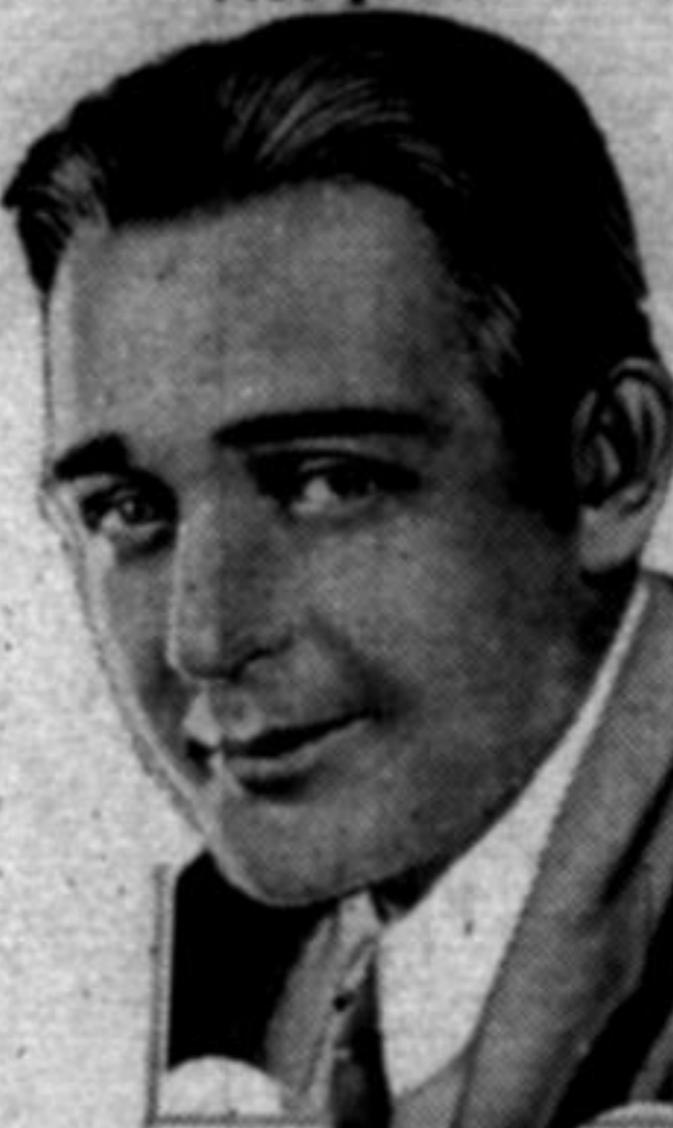
Wallace Reid in the Paramount Picture, "The Ghost Breaker"