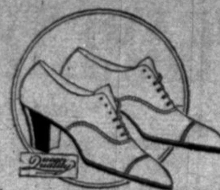
Black Kid Oxford in Combination Last. Will fit the Tenderest Foot. $7.00 Also in Brown Kid at $5.00 to $10.00

Fashion says: "Shoes must be smart." And Good Sense adds: "They must be comfortable."