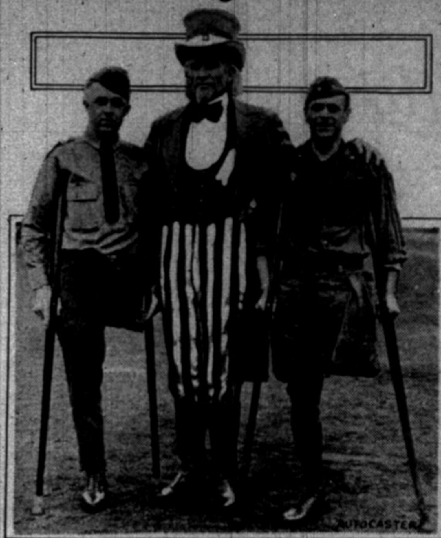
Living pictures no less than drawn pictures tell their story at a glance. Here is a photograph of a living combination used to advertise the recent Chicago Carnival for Disabled Veterans. Students of human ingratitude can learn a lesson from this story without words.