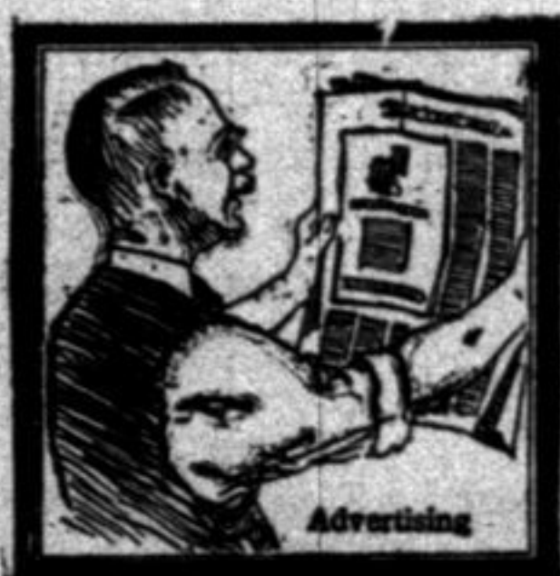
Art's D. 131