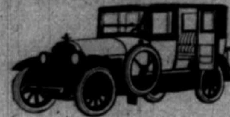
The new, improved Haynes 75 seven-passenger Sedan