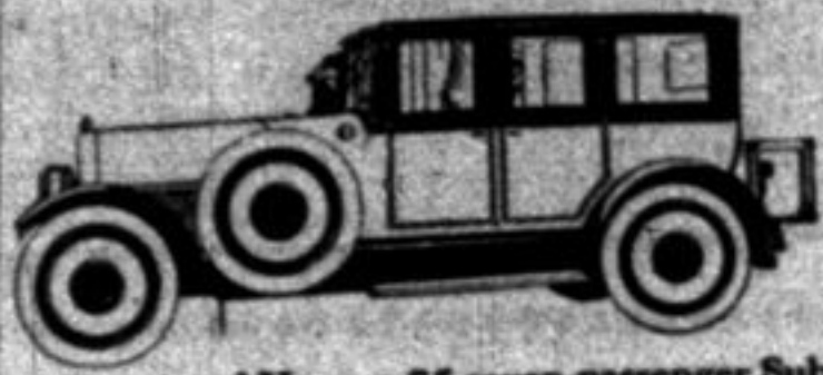
The new, improved Haynes 75 seven-passenger Suburban