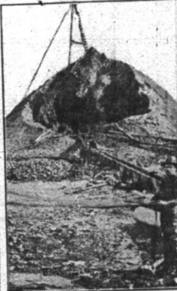
Getting Gold Out of Gravel.

Gold was first discovered near Nome in 1898, in one of the numerous creeks that rise in the hills back of the town