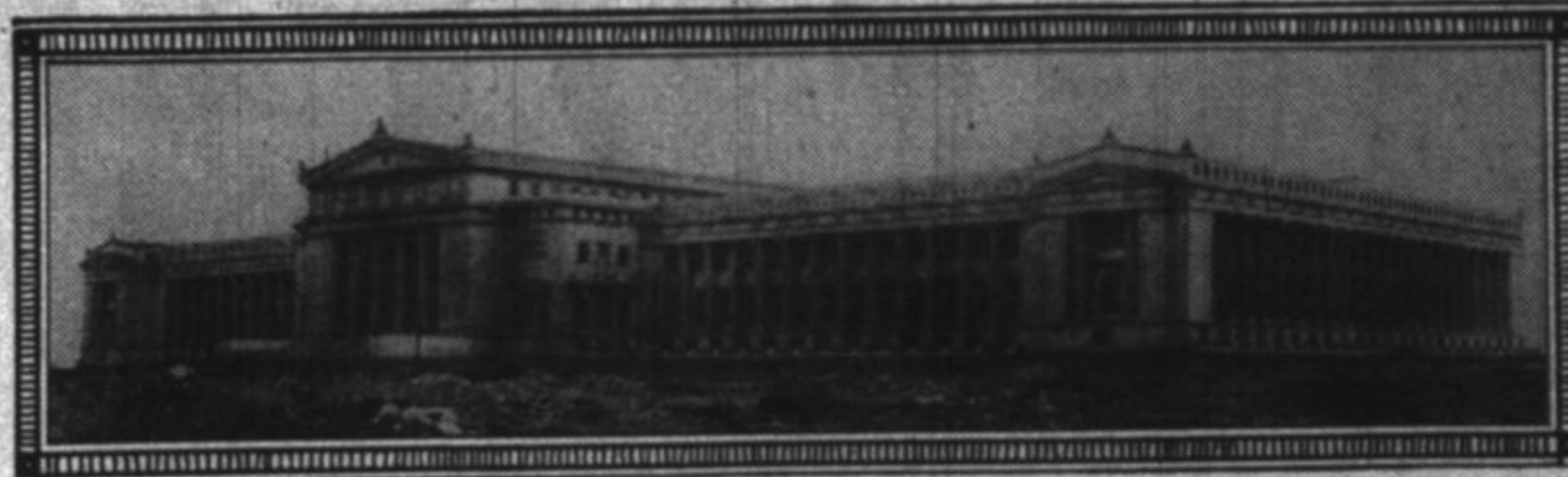
Field Museum, Chicago, 700 feet long, 350 feet wide

Where Bargains Are Found 15 N. Second St. First Door North of Sweetland's