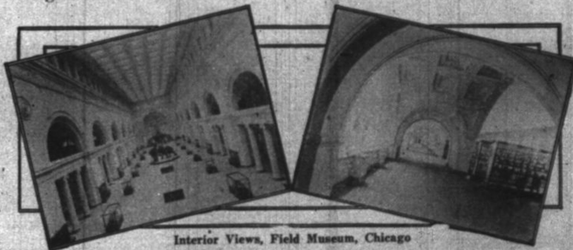
Interior Views, Field Museum, Chicago

Highland Park Ticket Office Phone Highland Park 1361