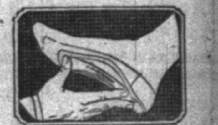
To strengthen the weak arch, lift the body's weight from the tender joint and prevent the forming of bunions, Dr. Scholl's Foot-Easener is especially designed. Price $3.50 per pair.

Examination and advice free. Not necessary to remove the stockings.