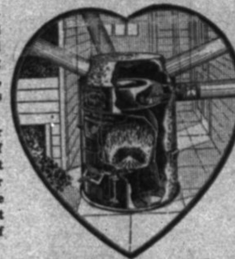
"The Heart of the Home"

They have discovered that cozy homes are an economic