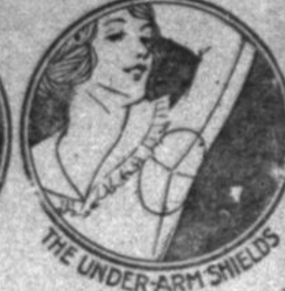
THE UNDER-ARM SHIELDS

Note the special features on these Dresses. On sale now. Mails' Dresses, Nurse Stripe Gingham. Also Blue Chambray House Dresses. Good full sizes at $2.98