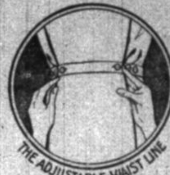
THE ADJUSTABLE WAIST LINE