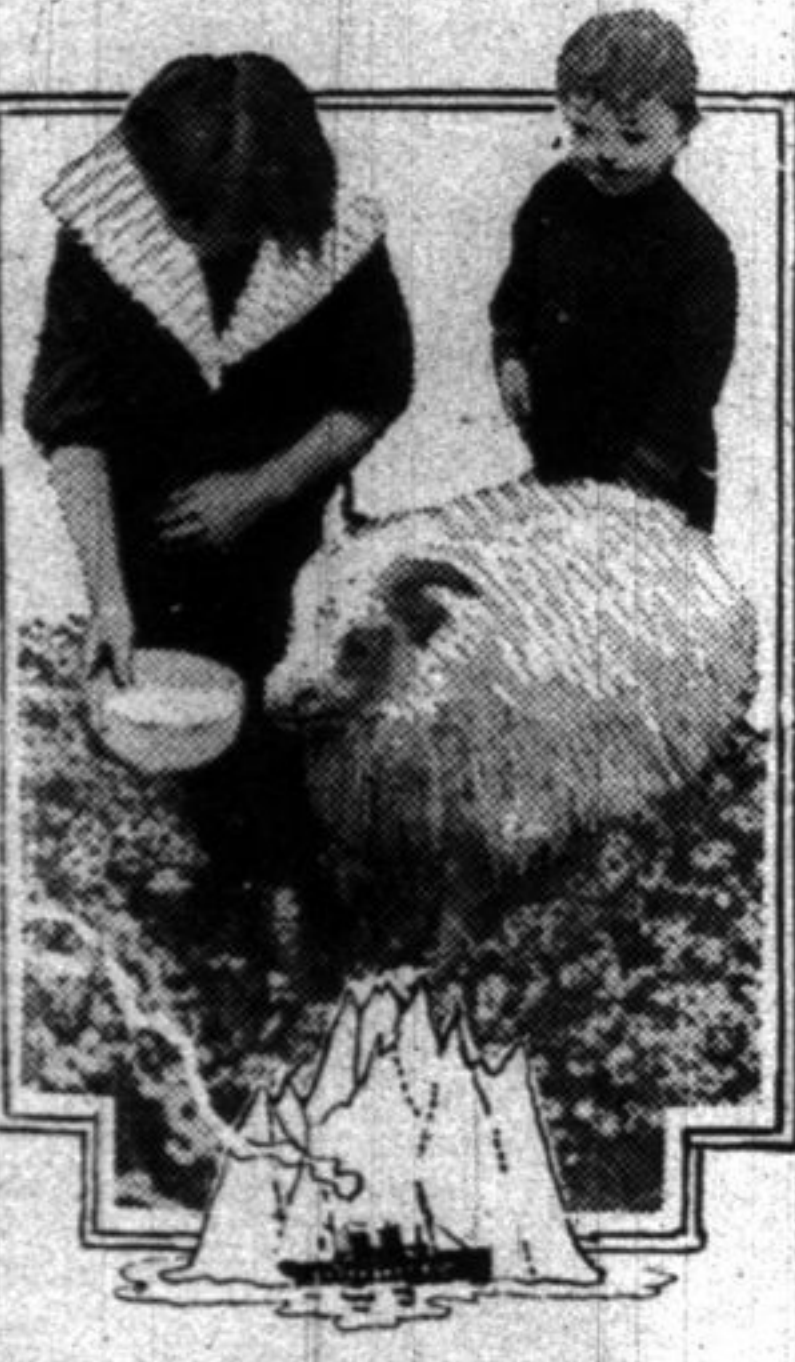
An Iceland Mary and Her Lamb; Also "Little Brother."

Did you ever hear "Mary Had a Little Lamb" in the Iceland tongue? Probably not! So, if it be of interest to you, try this: