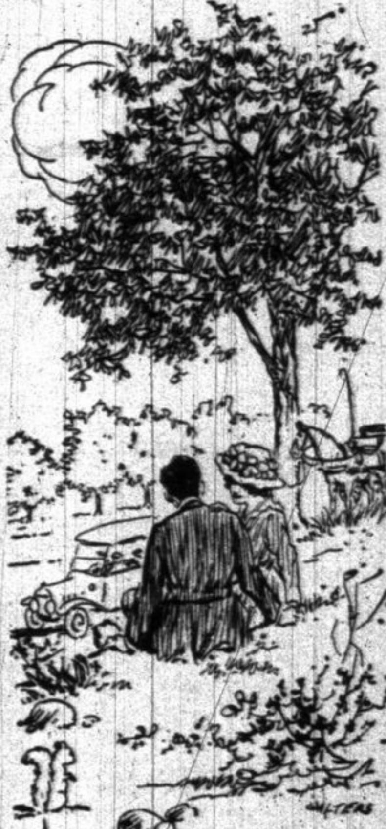
"I Hate All Automobiles."