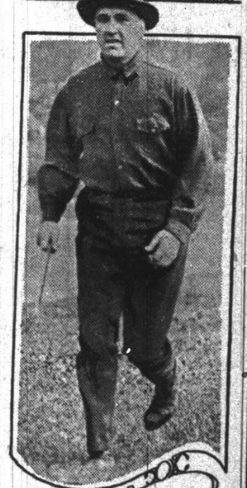
The horde of backers of former champion Jess Willard may have the opportunity of again showing their faith. Tex Rickard says he has word from Willard, who is now in the mountains undergoing a strenuous training which indicates that Jess is thinking "right" and that he is going to try and redeem himself for his miserable Toledo showing.