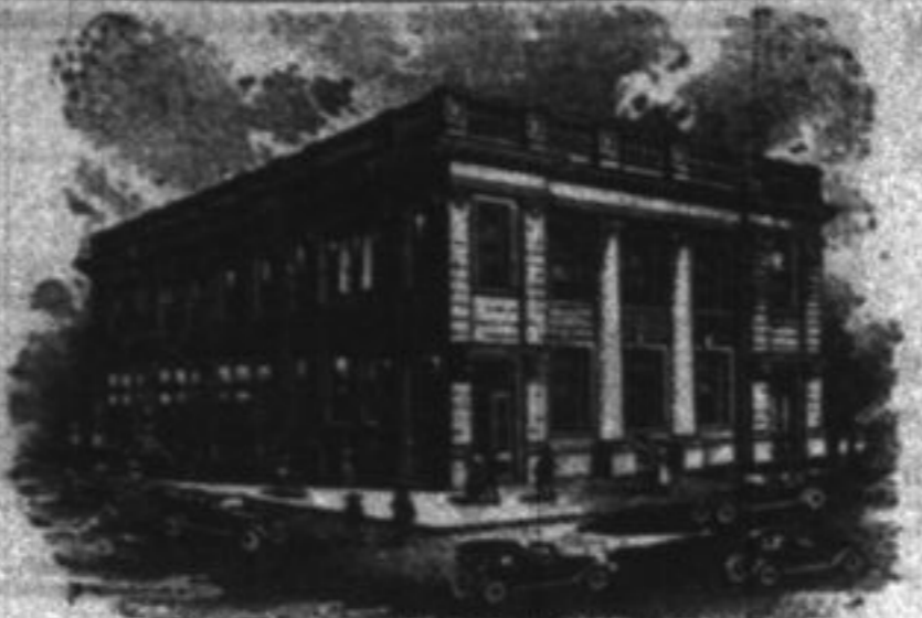
The Bank of Personal Service