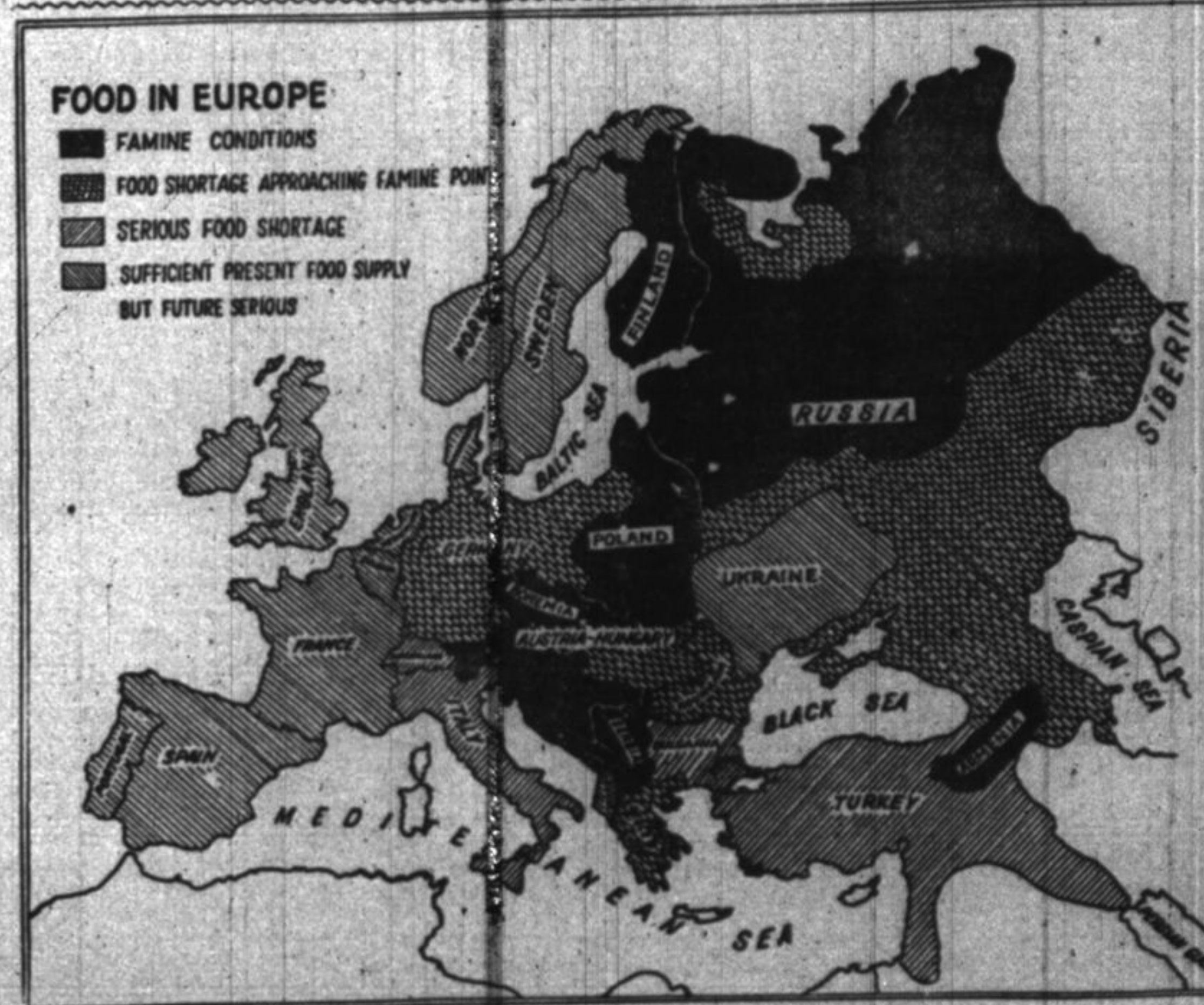
Prepared by the United States Food Administration, Illinois Educational Division.