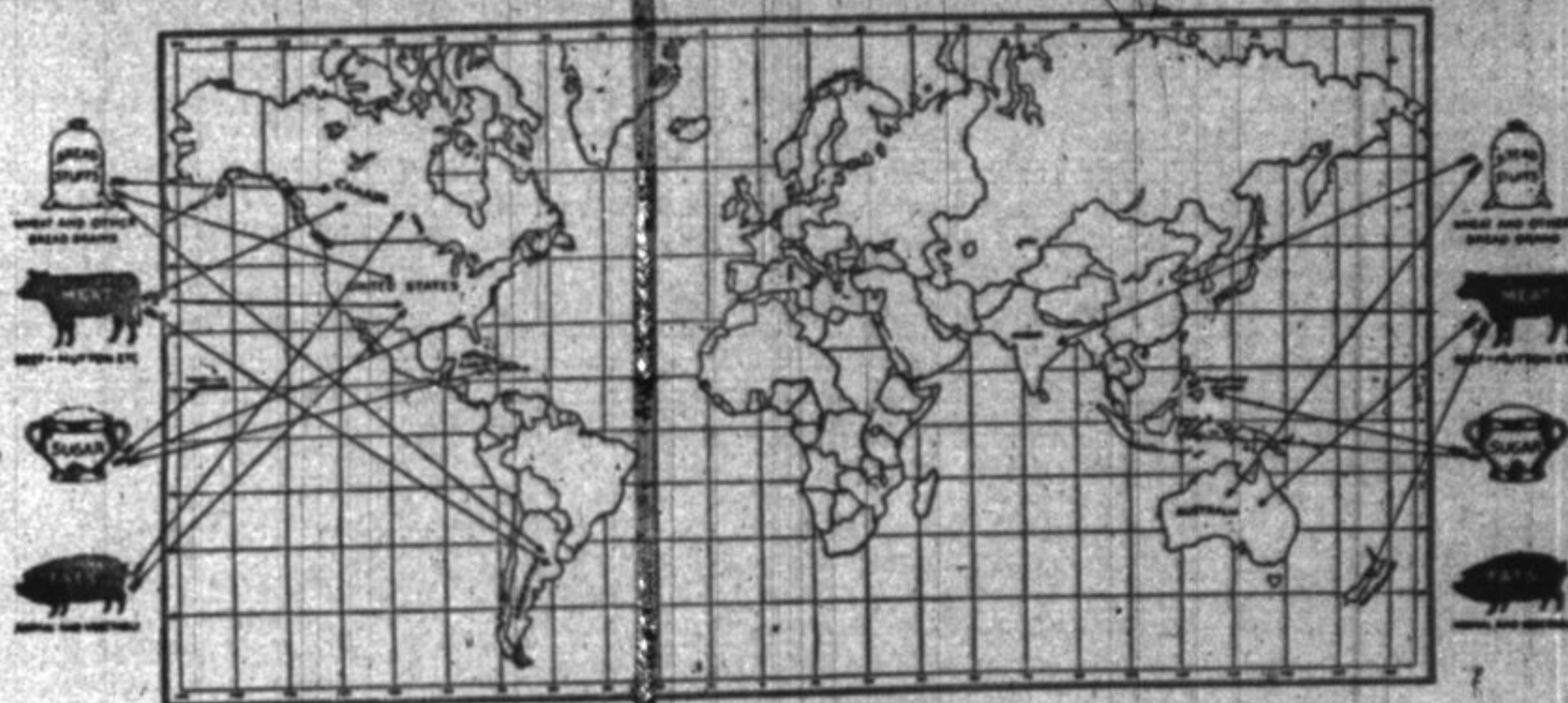
Where Europe Must Get Its Food.

MILWAUKEE TICKET OFFICE Sixth & Clybourn Phone: Grand 945