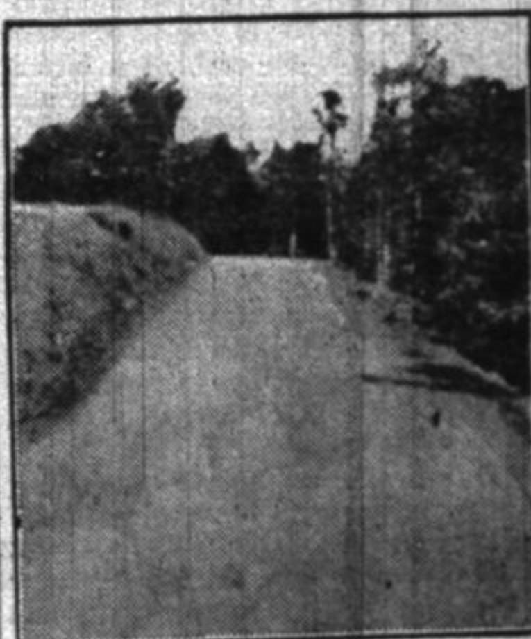
Good Road in West.

(By E. B. HOUSE, State Agricultural College, Fort Collins, Colo.) I have heard considerable discussion lately concerning the policy of our state highway commission in constructing the kind of roads it has decided upon, and it is often argued that the only type of road is the so-called permanent road, the one that needs no maintenance. If one will take a pencil and do a little figuring, he can easily convince