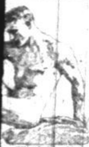
Training Has Arrived