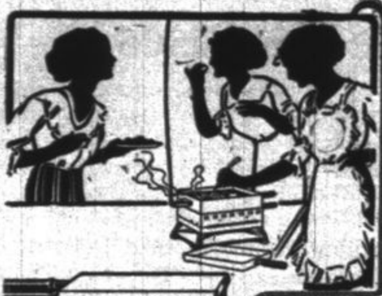
Electric Way The Best Way