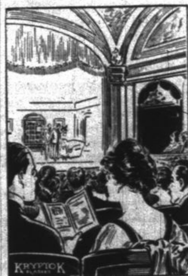
Eyes are Worth as Much as Life Itself