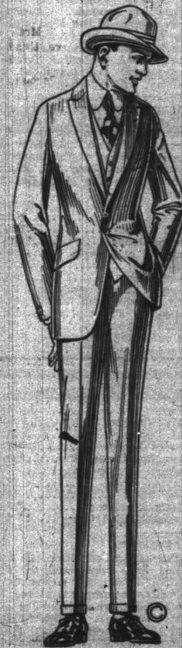
Ask to see the man who does the measuring.