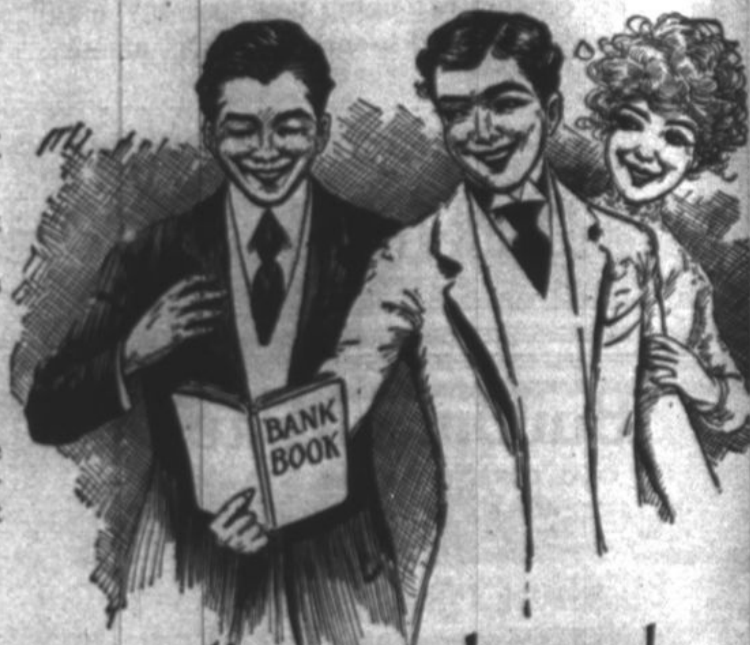
Men with money began by putting money in the Bank.

Look at the different Clubs in table below and select the one you wish to join, the 1c, 2c, 5c, 10c, 50c, $1.00, $5.00—then come to our Bank with the first weekly payment. We will make you a member of the Club and give you a Christmas Banking Club Book showing the Club you have joined.