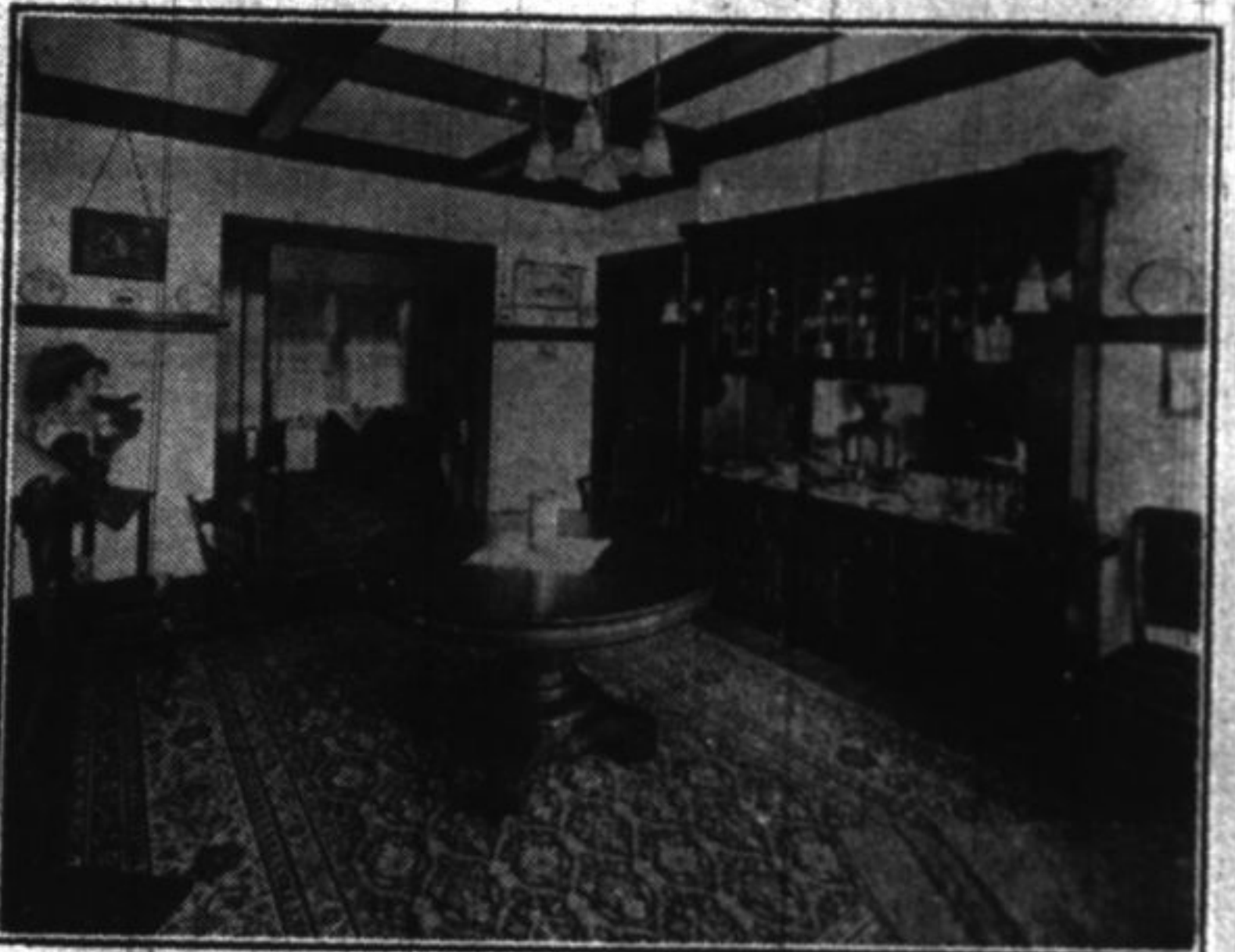
INTERIOR VIEW—AN ATTRACTIVE DINING ROOM.

The interior view of the dining room in this residence shows a built-in sideboard and china closets. This sideboard extends into the room about ten inches, with panel sides and bracket effect for the head casing. The doors are cut up with wood mullions. These doors are of French glass. Below the china closets is a space for cut glass, inclosed at each end with wood panels. In the center of the sideboard, below the counterself, is a wide drawer for table linen. At each side there are drawers for silverware, etc. Around this room is a plate rail for the china. On the ceiling beams run both ways and the half beam around the entire room. Cost to build, exclusive of heating and plumbing, $5,000.