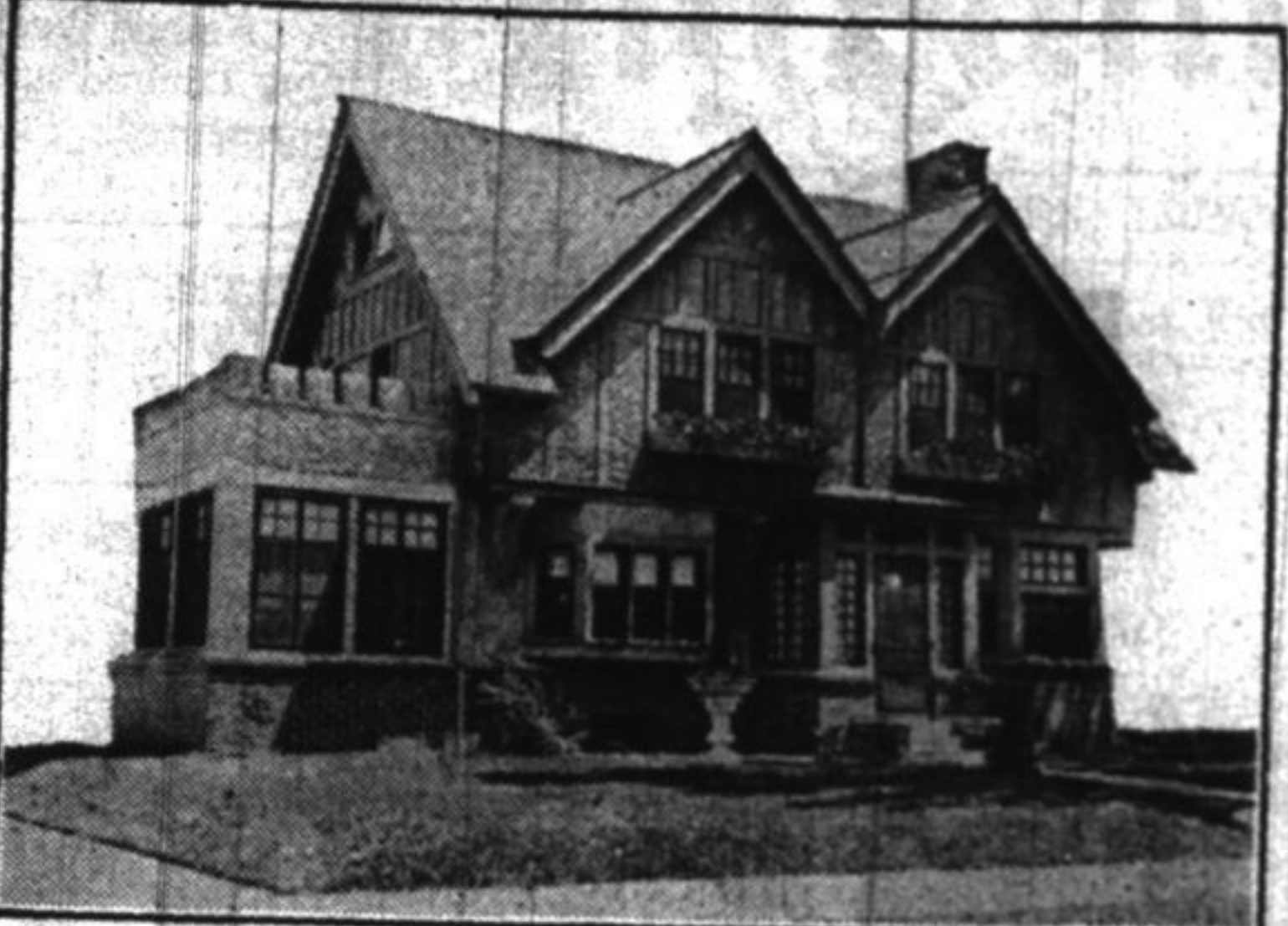
PERSPECTIVE VIEW—FROM A PHOTOGRAPH.