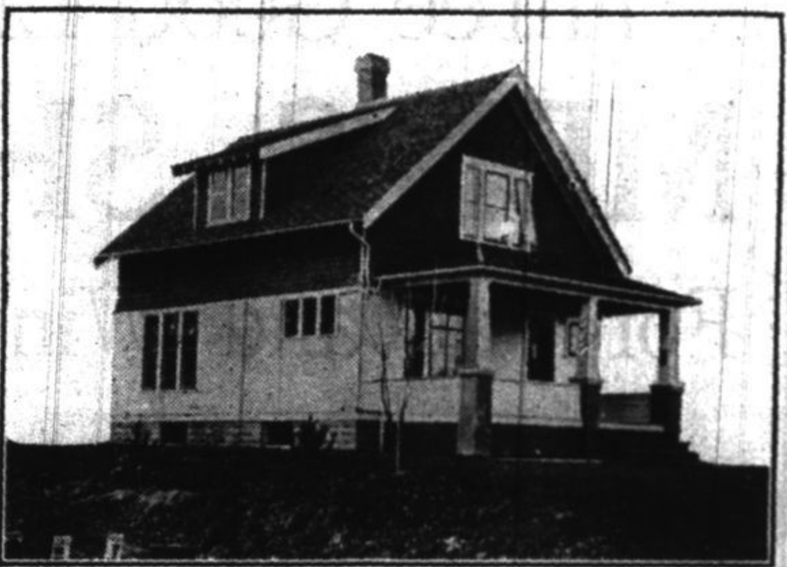
PERSPECTIVE VIEW—FROM A PHOTOGRAPH.