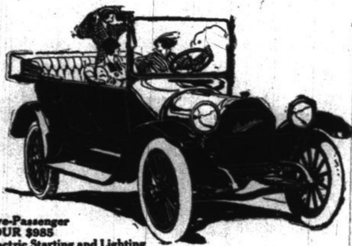
Five-Passenger FOUR $985 Electric Starting and Lighting Full Floating Rear Axle—Extra Size Tires