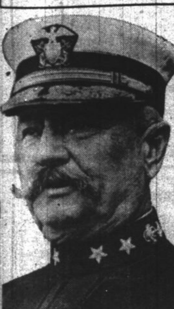
As rear admiral in command of the Atlantic fleet Charles J. Badger is the man on whom devolves responsibility for what happens in Mexican waters.